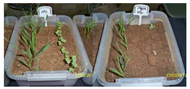
Photo 2: No fertiliser (left) was better than 25 kg/ha of urea (right) for the canola in this seed sensitivity test.

The difference in tolerance between canola and wheat can be seen in the trays in Photo 2. They were prepared with urea applied with the seed simulating a 33 cm row spacing with a seed furrow width of 25 mm, or an SBU of 7.6%.