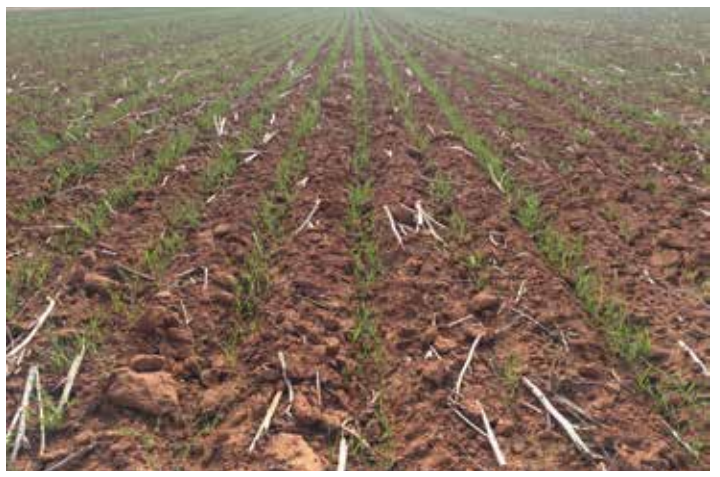
Photo 3: An example of a twin row seeding system with Gregory wheat at Grenfell in 2018.

The safest application equipment allows the fertiliser and seed to be applied in separate bands. Applying fertilisers below and to the side of the plant line with a minimum of 50 mm of separation is the most effective method of avoiding seed or root contact in winter crops. Also consider twin row, dutch opener type systems that give excellent flexibility with fertiliser applications.